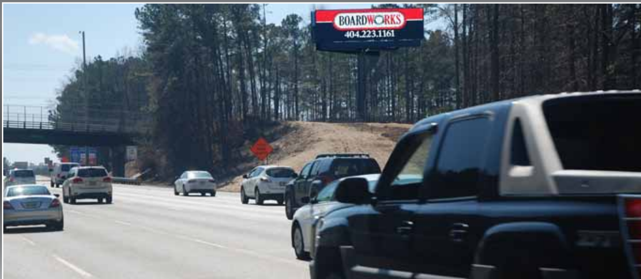
West Side of GA 400 .70 miles North of Northridge Road (Exit 6) Facing North for Southbound Traffic